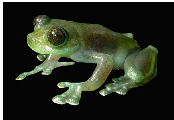
Figure 1. An adult female of Cochranella orejuela from the Bosque Protector Mashpi, province of Pichincha, Ecuador (DHMECN 04309).

Cochranella orejuela (Duellman & Burrowes, 1989) was previously known to inhabit the Pacific foothills and low montane Andean regions of southwestern Colombia between 800 and 1250 m elevation, with two localities at the departments of Cauca and Nariño (Duellman and Burrowes 1989) and a third one at the department of Valle del Cauca (Castro et al. 2004). Cochranella orejuela was recently collected in three localities at the province of Pichincha, northwestern Ecuador: DHMECN 04309 (Figure 1) from the Bosque Protector Mashpi (78°52'2.32" W 00°10'2.34" N; 1200 m), collected by M. H. Yáñez-Muñoz and C. Castro M., on 02 May 2007 (Figure 2); DHMECN 04551 from the River Chalpi (78°51'28.87" W 00°13'32.38" N; 615 m) and DHMECN 04552 from the River Anope (78°48'58.34" W 00°12'45.54" N; 1080 m), both at the surroundings of the town of Saguangal, collected by M. Herrera-M, S. Villamarín C. and J. Rivadeneira R., on 23 June 2007 (Figure 2).