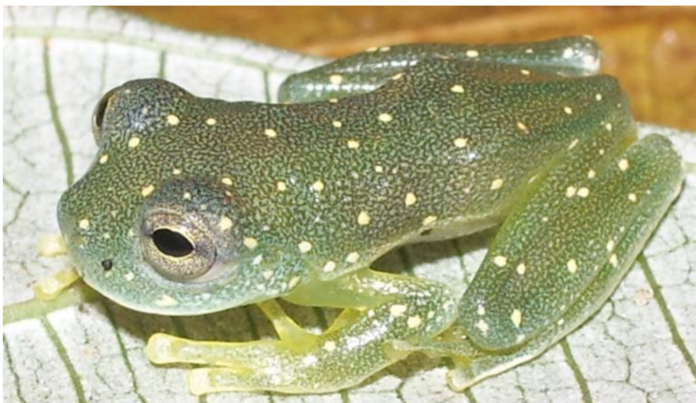
Figure 2. Individual of Cochranella adenocheira collected in the municipality of Juara state of Mato Grosso, Brazil.