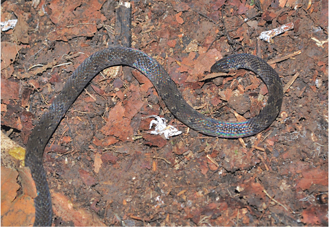
Figure 1. Dorsal view of Atractus medusa (USFQ 191.101109) collected at Tundaloma, province of Esmeraldas, Republic of Ecuador.

cream marks (Fig. 1–2). The Ecuadorian specimen of A. medusa was found active at night (19h00) among leaf-litter on the floor of the forest. It was on a hilly area covered by secondary non-seasonal lowland evergreen forest. An individual of Oxyrhopus petola was found ca. 0.2 m apart from the A. medusa .