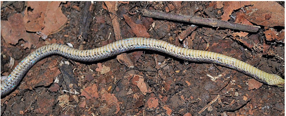
Figure 2. Ventral view of Atractus medusa (USFQ 191.101109) collected at Tundaloma, province of Esmeraldas, Republic of Ecuador.